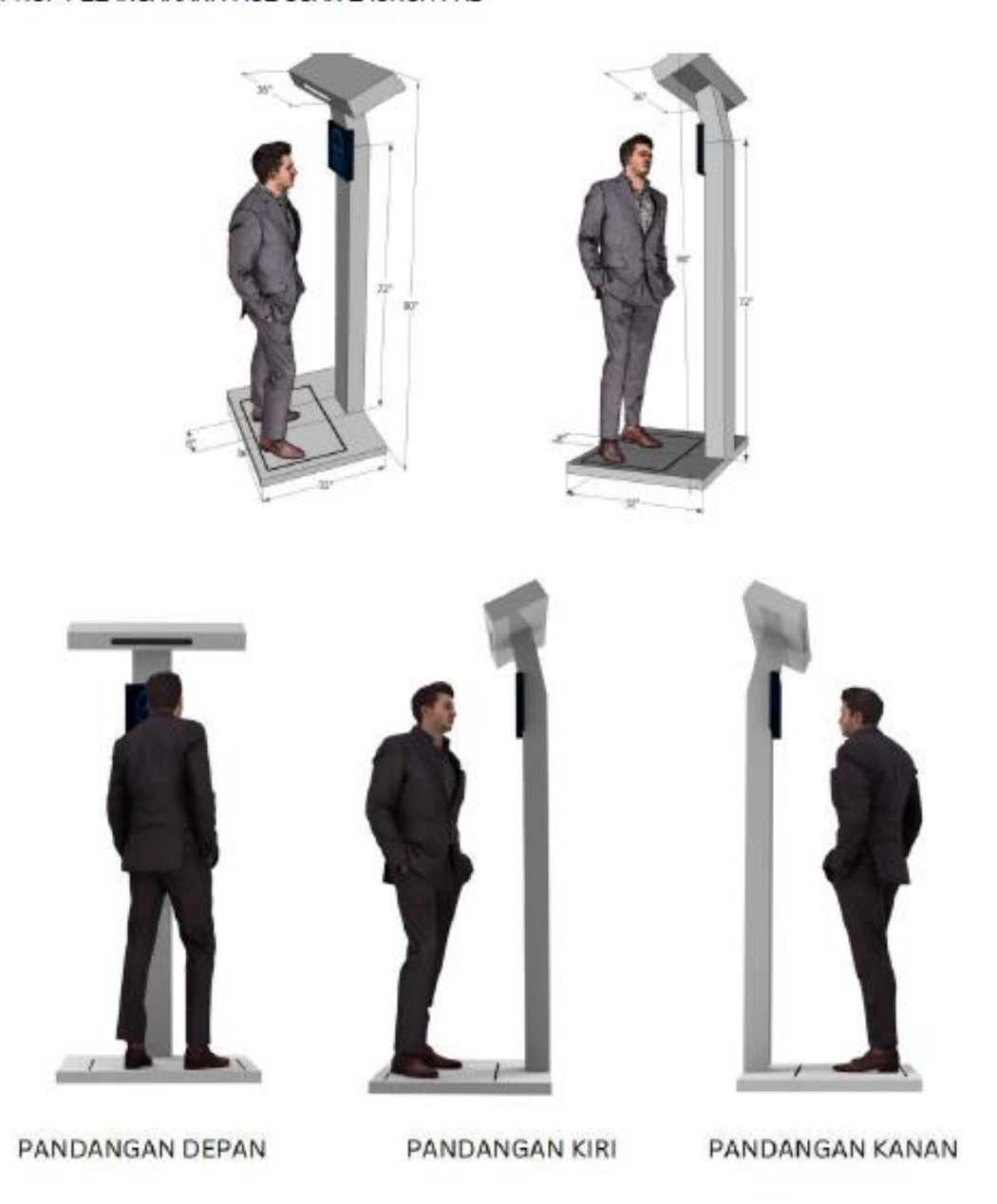
Gimmick Launching /