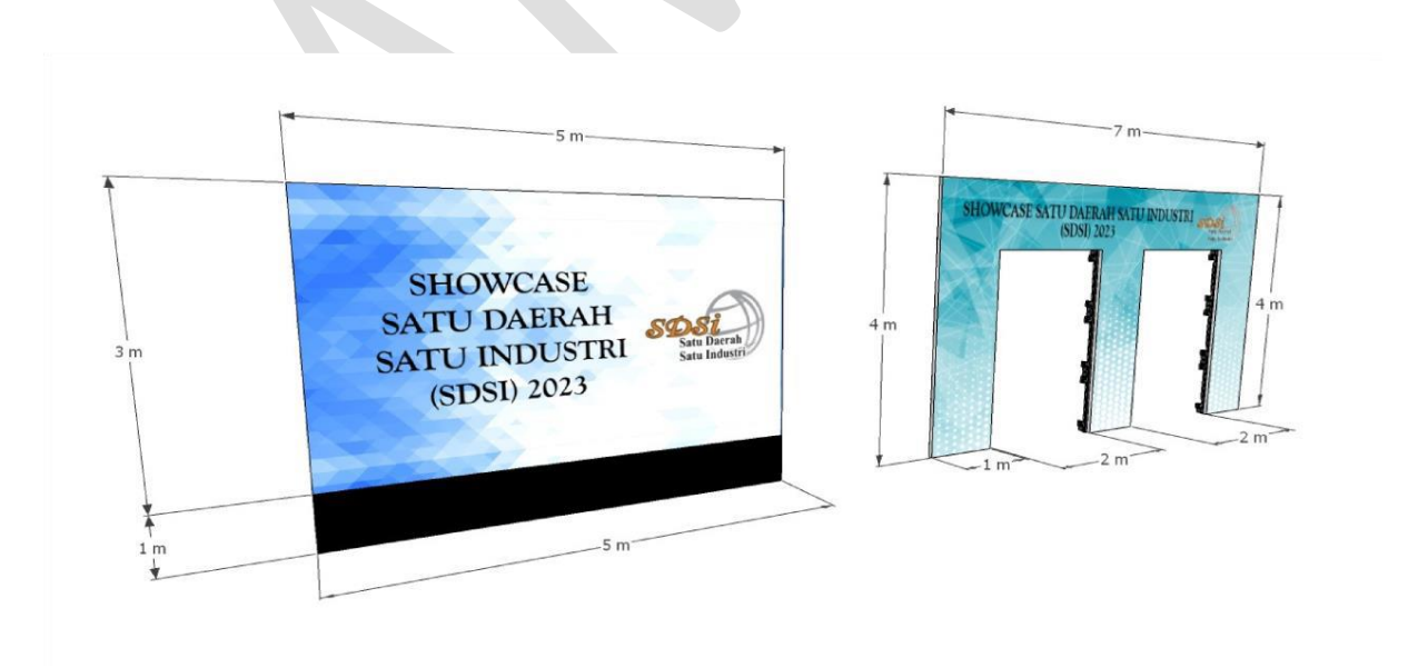
View of Promotional Posters/Bunting/etc